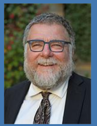
Thursday, February 9 4:00PM -5:30PM

Loyola University Chicago McCormick Lounge 1032 W. Sheridan Rd. Chicago, IL 60660