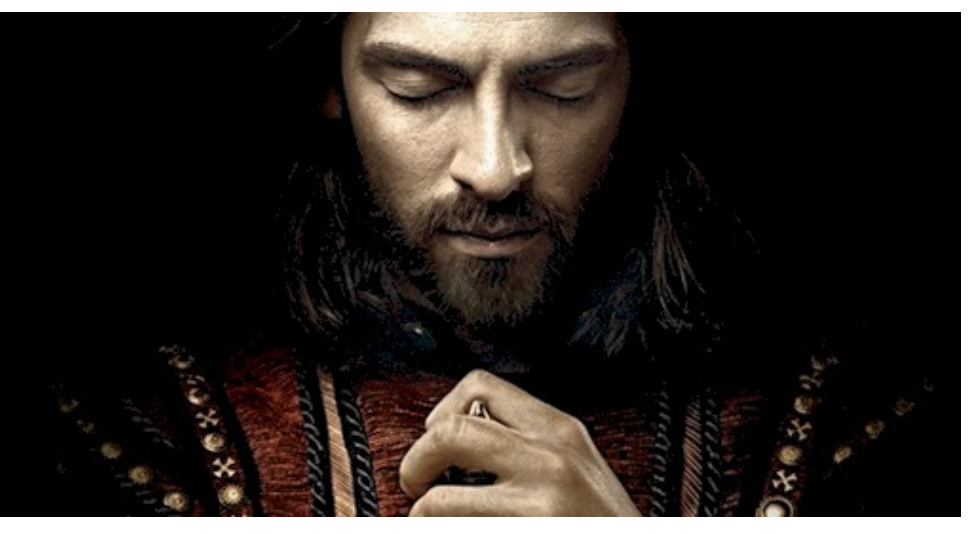
Full Length Independent Feature Film Ignacio de Loyola